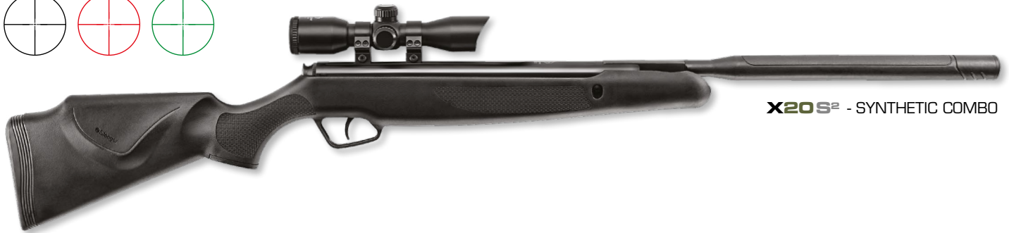
X20S 2 - SYNTHETIC COMBO